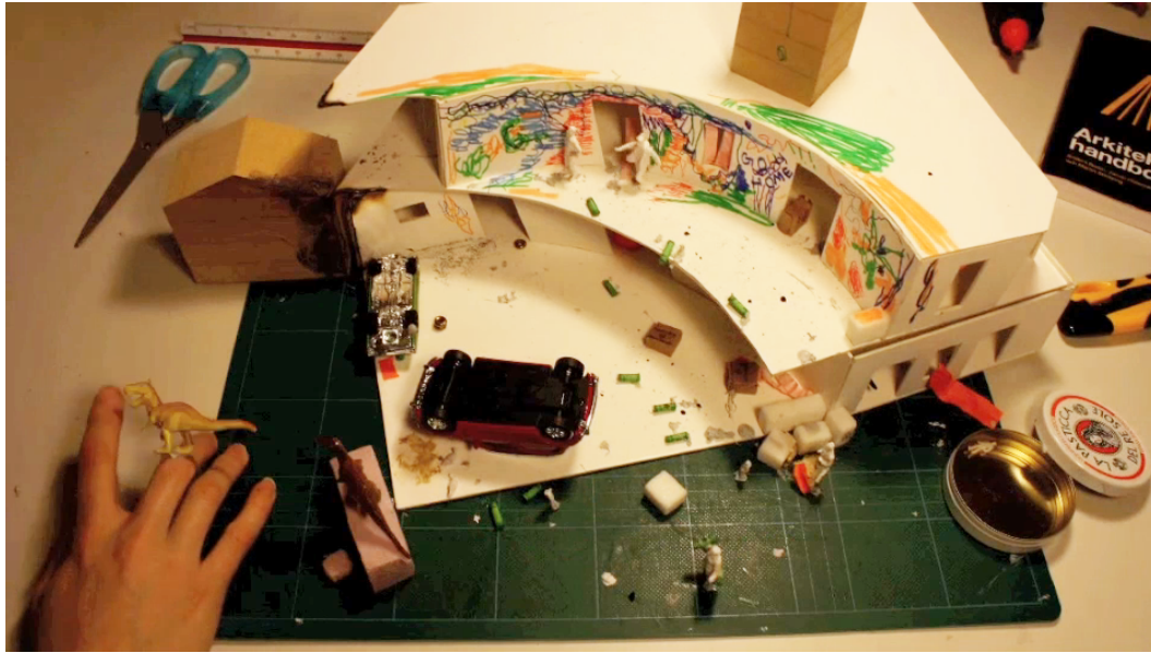
Four frames from 'Making a Move'; showing how a building changes over time