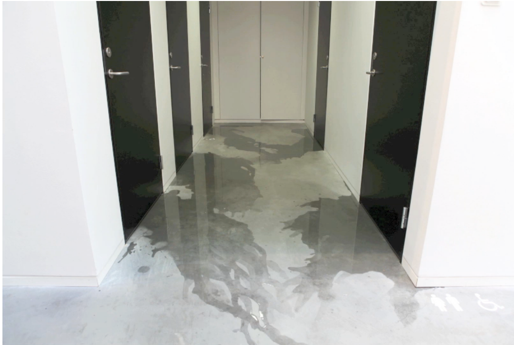
A single frame from an animation produced during the course (untitled), where the students used stop motion to allow water to defy gravity