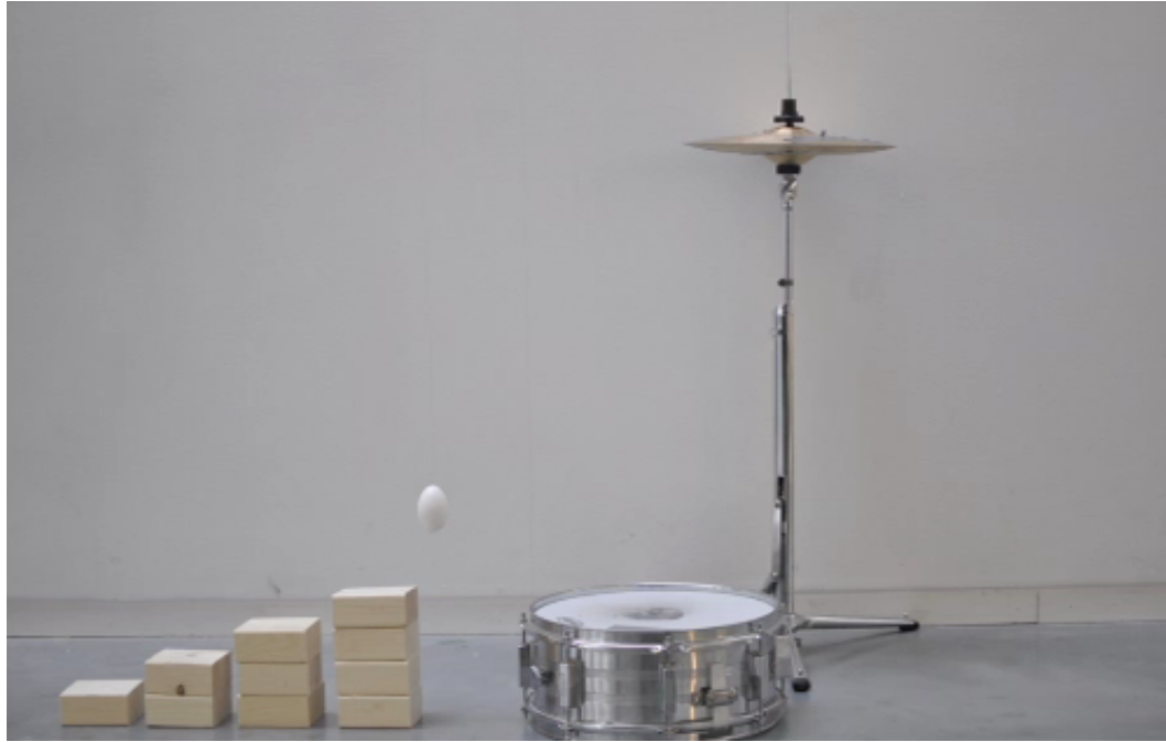
A single frame from an animation produced during the course, entitled 'Eggzit'

the object should be placed given the pace and rhythm of previous frames. With live preview, you are able to constantly review and play the animation back and forth as it is being created, which also helps prevent making massive mistakes (such as objects disappearing, the camera is moved, etc.)—and if you make them, help you realize it soon after they are made—which due to the step-by-step nature of the stop motion animation process are extremely difficult to correct afterwards.