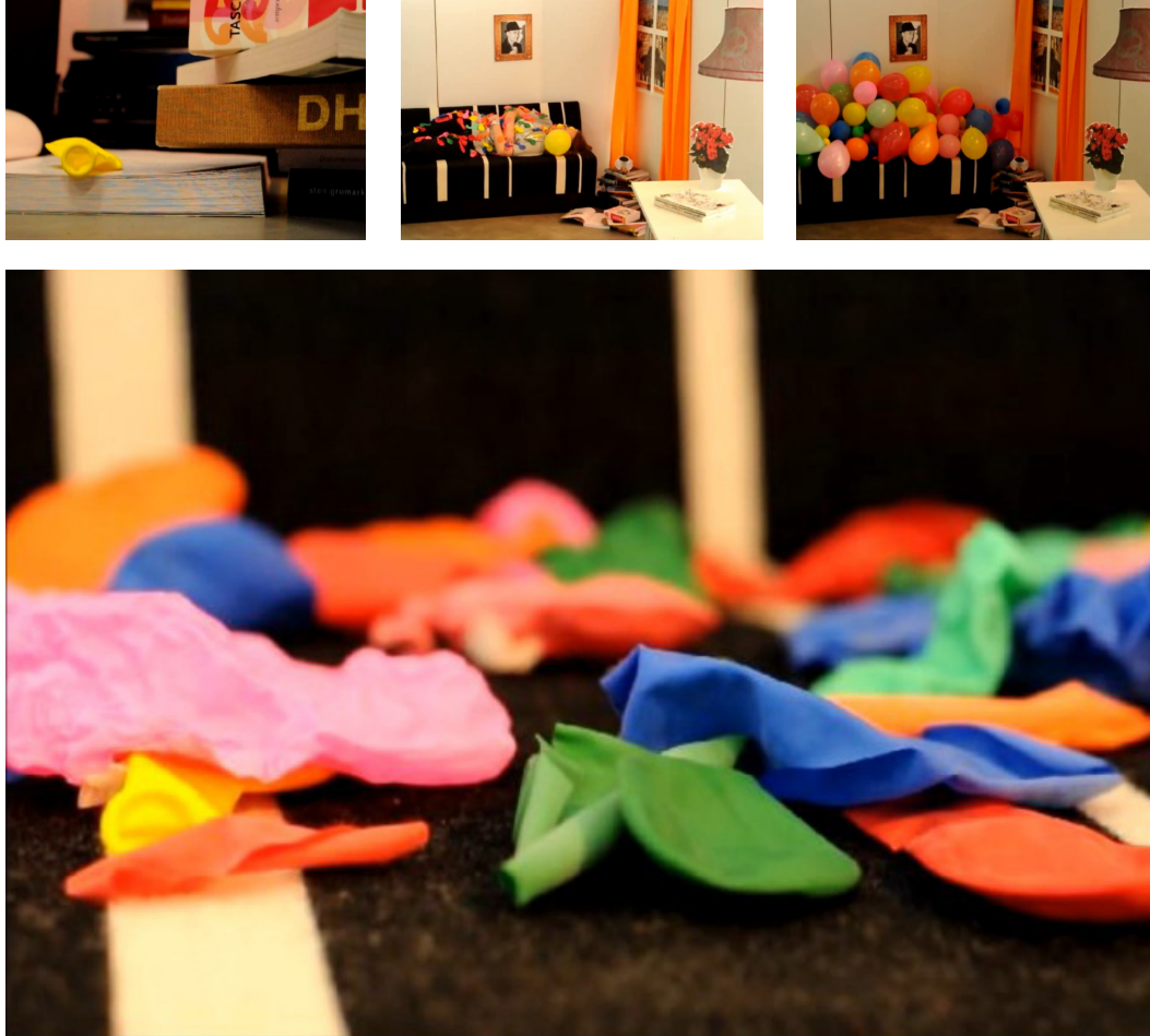
Four frames from another animation produced during the course, entitled 'Power Nap'

previous work with interaction design students; that students with access to better equipment (such as semi-professional cameras) do not generally generate better animations. In fact, we once more saw the opposite tendency; that students with the simplest gear often ended up producing the most interesting results.