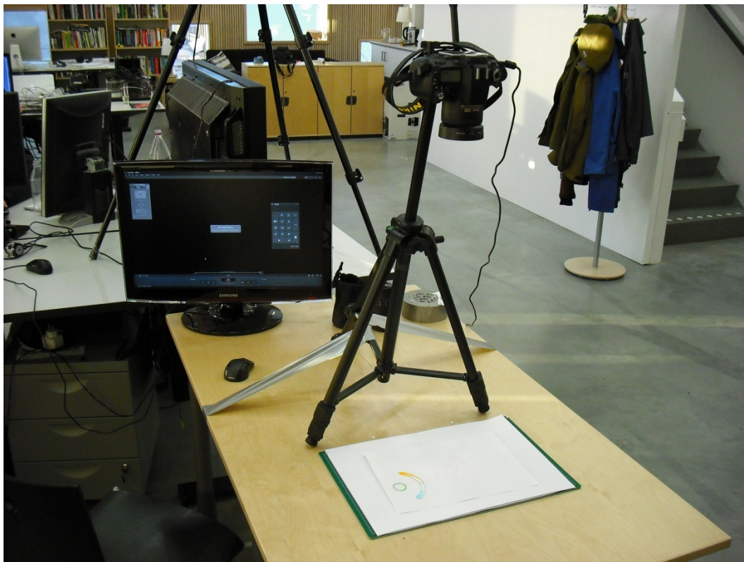
An example of a typical stop motion animation setup

In the afternoon on the first day, still in the auditorium, we introduced the stop motion hardware and software setups (or 'kits') that the students would use throughout the course. We then walked the students through plugging in and setting up their kits and walked them through the software they would use. With one kit properly set up, we recorded a quick animation as an example of the workflow and to get the students going. Students could ask any questions they wanted and we answered to the best of our knowledge and shared a few tips and tricks. Before calling the class off, we divided the 50 students into five groups.